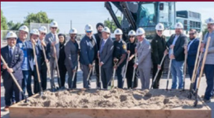
Council members at Peel Regional Police's new 23 Division groundbreaking ceremony. (June 2024)